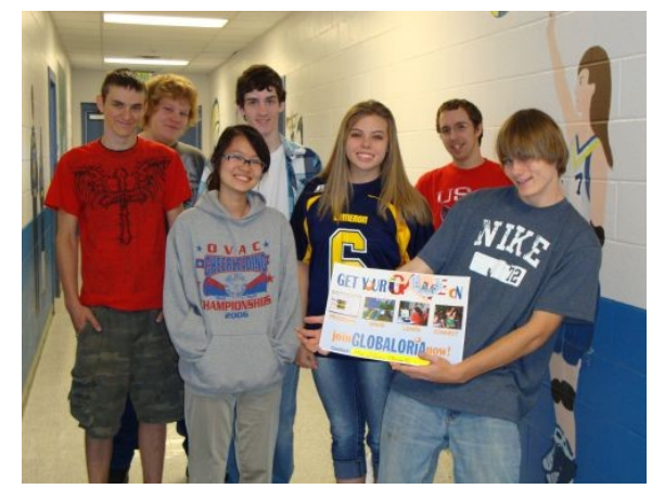
See you in the Globaloria Blogosphere!

Since 2006, the Globaloria Platform and Curriculum has been piloted at American University, New Orleans, and West Virginia schools and colleges. It has been customized for different grade-levels (middle school, high school, university) and applied to various topics and subjects (Business Education, Mathematics, Social Studies, Biology, Language Arts, etc.). Teachers and students are involved in comprehensive professional development summer training programs and ongoing training to support them throughout the academic year.